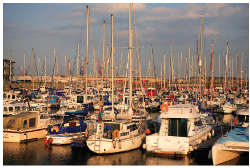
Evening light, Swansea Marina.