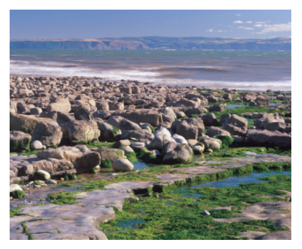
Above: The hills of Exmoor from Nash Point.